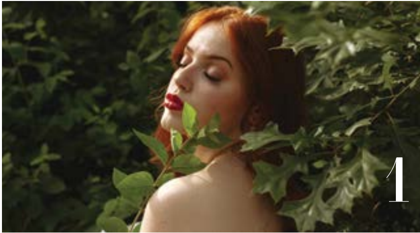
Rest Within the Forest by Colette D., photographer