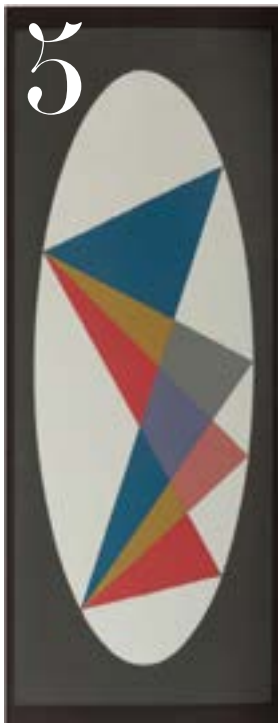
Crossing Inside the Ellipse by Wei X., painter