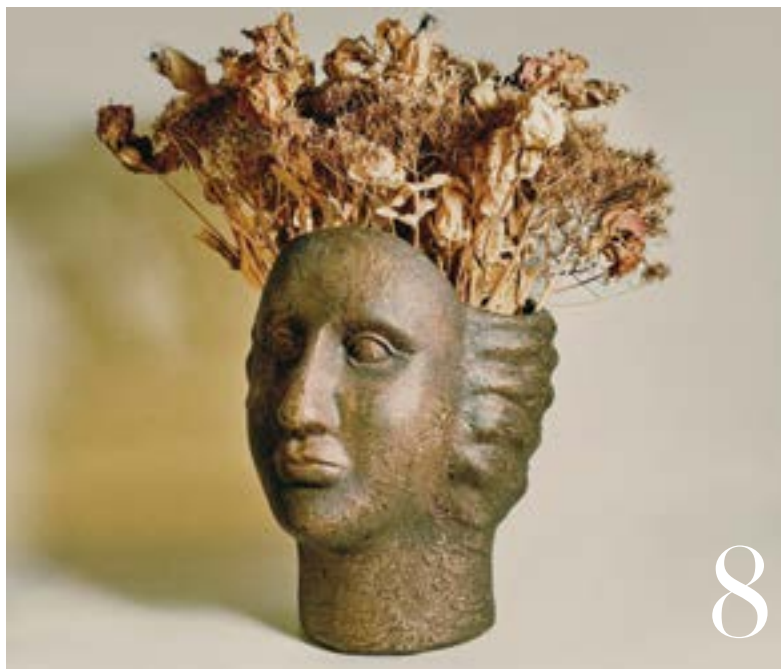
Repose by Arturo F., sculpture artist