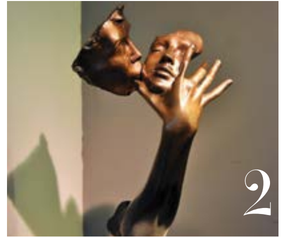
A Kiss by Arturo F., sculpture artist