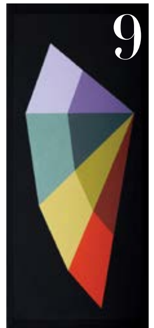
Polygon Tints and Shades by Wei X., painter