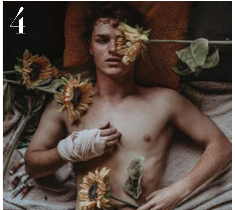
Daisy Upon the Eye by Colette D., photographer